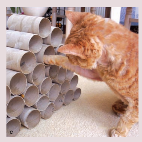
Figure 5 A selection of commercially available and home-made feeding devices. For weight control, the food must be measured as part of the daily ration.