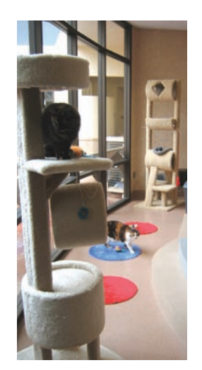
Figure 4 Environmental enrichment contributes to weight loss programs by promoting increased activity and, it appears, improving client commitment.

Environmental enrichment has been extensively studied as it pertains to animal welfare.30-37 It has also been looked at briefly in the context of how it affects weight loss.38 In a study of 19 two-cat indoor households, where one cat was overweight and the other of normal weight, nine households were randomly selected to be the control group. Their weight loss program consisted of counseling and directions to feed the two cats separately in two or more meals per day, closely monitoring the obese cat's food intake. The goal weight was 90% of the cat's initial weight, which allowed cats to lose 1-1.5% of their initial weight per week. The 10 treatment households received the same counseling and feeding recommendations but, in addition,