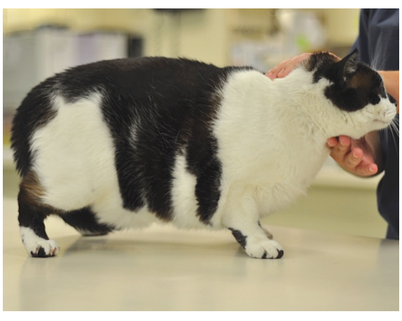
Figure 1 Obese cat weighing 8.6 kg (ideal weight 4.5 kg).