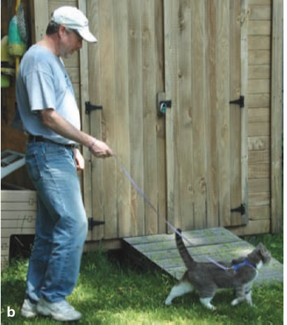
Figure 3 Exercise, in any shape or form, will help.