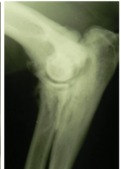
Fig 3: Mediolateral radiograph of the left elbow joint, demonstrating severe osteoarthritis in the elbow joint.

of obesity. Instead the aim is to manage the pain medically and continue with the weight loss programme.