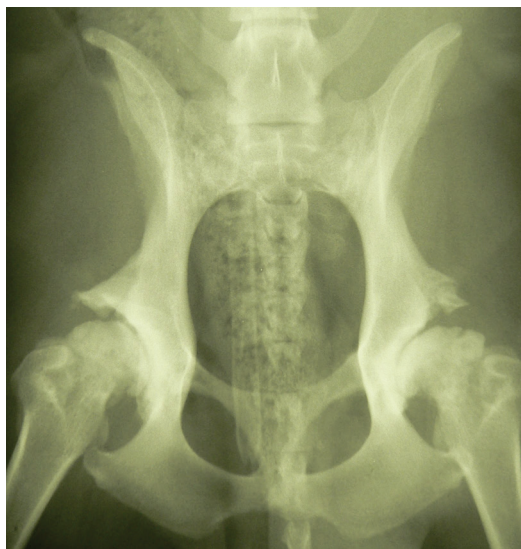
Fig 2: Ventrodorsal radiograph of the pelvis, demonstrating severe osteoarthritis in both coxofemoral joints.