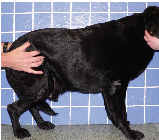
Fig 5: The same labrador retriever at the end of the weight loss phase (10 months). The weight at this stage was 38.0 kg, and the body condition score was 7/9

the end of the weight loss period, which further improved the dog's mobility. Further surgical procedures were not undertaken based on clinical signs but there was potential for total hip replacements to have been performed as well if the clinical situation justified it.