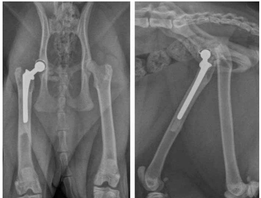
Fig. 3 Cranio-caudal and lateral radiographs of a cat made eight weeks after cemented total hip replacement. The femoral polymethylmethacrylate (PMMA) mantle is 1.0 to 1.5 mm thick. The PMMA fills the femoral canal for 6 mm distal to the stem tip. The thin PMMA mantle around the prosthetic cup is not clearly visible. Some PMMA inadvertently extruded on the caudo-ventral aspect of the acetabulum.

(PROM) of hip flexion and extension in the operated and contralateral limb that was tolerable to the non-sedated patient (17). Girth and goniometric measurements were made in triplicate by the same examiner (ND) who was unaware of the surgical procedures and operated sides.