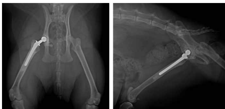
Fig. 4 Cranio-caudal and lateral radiographs of the cat in Figure 3 made 14 months after total hip replacement. Periosteal, cortical, or endosteal changes or radiolucent lines at the bone polymethylmethacrylate interfaces are not visible. The prosthetic cup and stem are stable.

and stem and the absence of complications were determined from these radiographs.